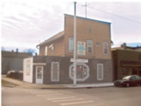
Multiple Use Property