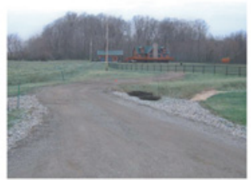
Unique Zoning and Large Acreage Homes