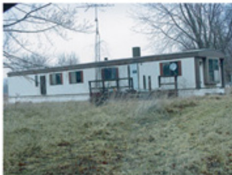
Single Wide Mobile Homes