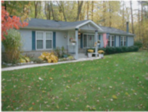
Double Wide Manufactured Homes